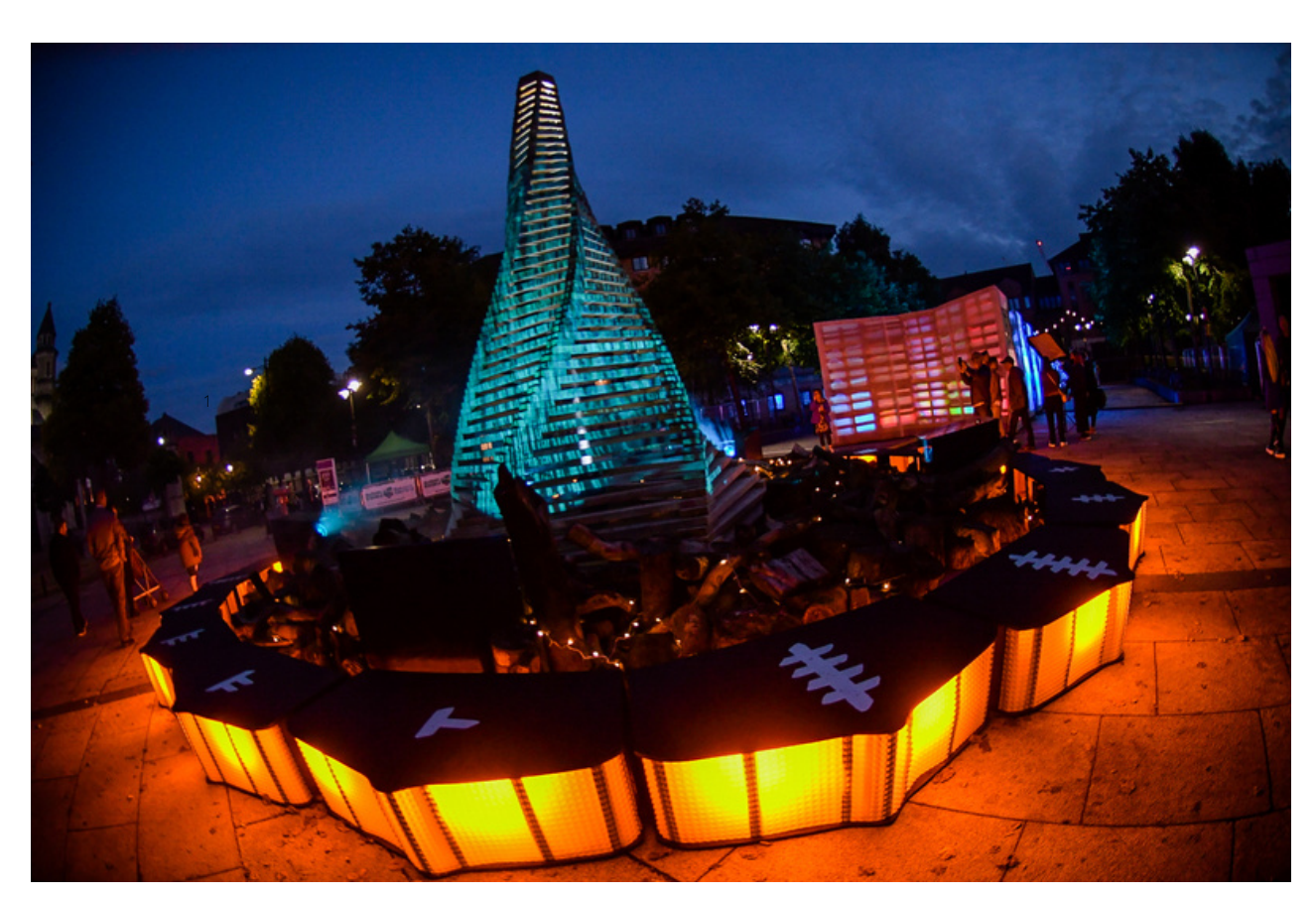
The Ogham Grove, Culture Night Belfast 2021

The Trust works with a wide range of city partners and stakeholders, including Belfast City Council, Department for Communities, Belfast Buildings Trust and the Destination CQ Business Improvement District (CQ BID).