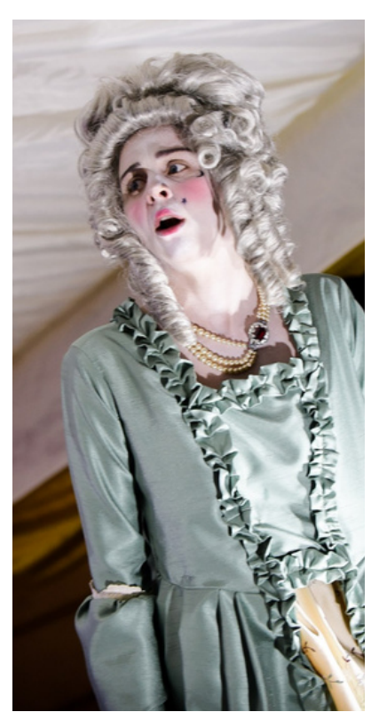
Arts events by CQ Trust throughout the years